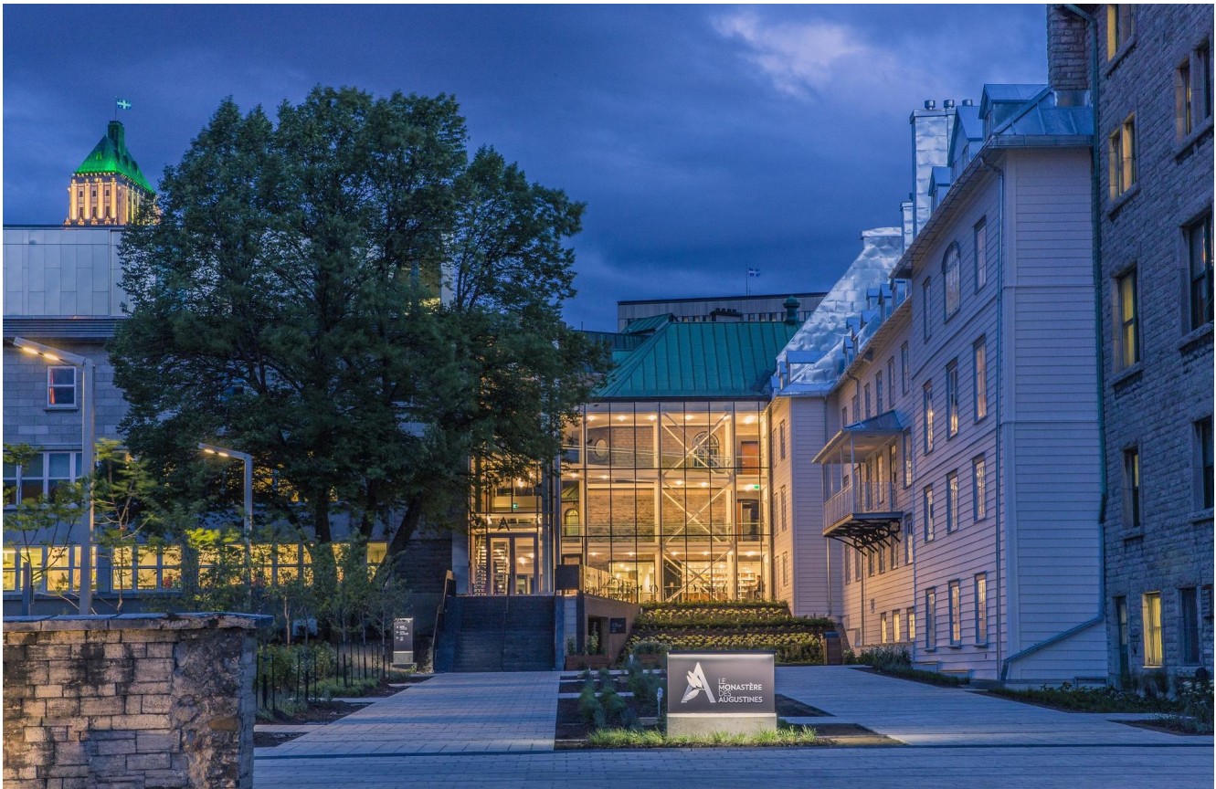
LE MONASTÈRE DES AUGUSTINES

beds, and private baths. Both room styles are super comfy and white-glove clean, but none has a TV or other high-tech distractions. (Though they offer WiFi throughout the hotel, we had a tough time getting Internet access.)