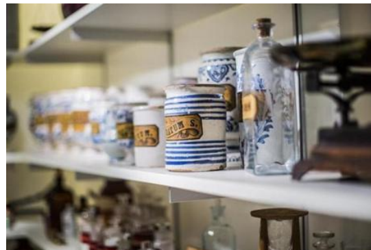
LE MONASTERE DES AUGUSTINES

Walk into the recently opened Le Monastere des Augustines, through a connecting entry of glass and steel grid, and you'll sense immediately that you're in a unique space. What will strike you most is its tranquillity, which causes you to immediately slow your step, take a deep breath, and relax. The property, housed in the wings of an ancient cloister dating to the 17th century, is a true oasis in the heart of the city — part hotel, part museum, and part retreat.