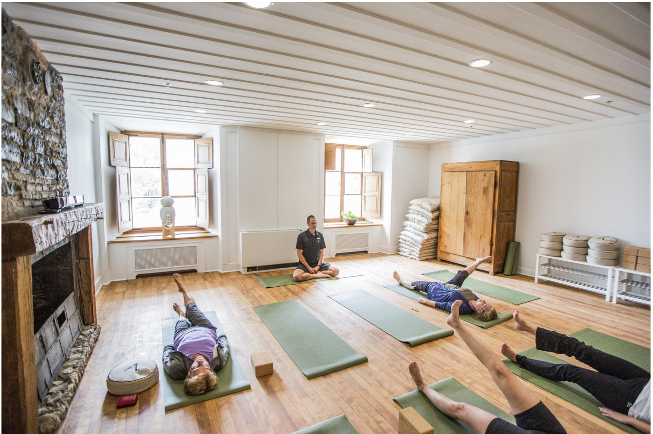
LE MONASTERE DES AUGUSTINES

You could stay within the protective walls of Le Monastere des Augustines, much like the cloistered sisters once did, but the sights and sounds of Old Quebec are at your doorstep. Go explore, then return to this calm, contemplative oasis to renew for the next day's journey.