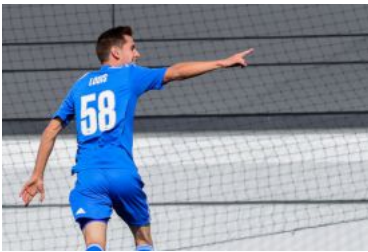
Pan Am Games