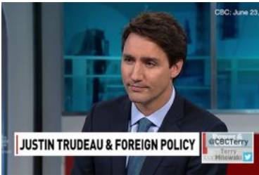
Federal Election 2015