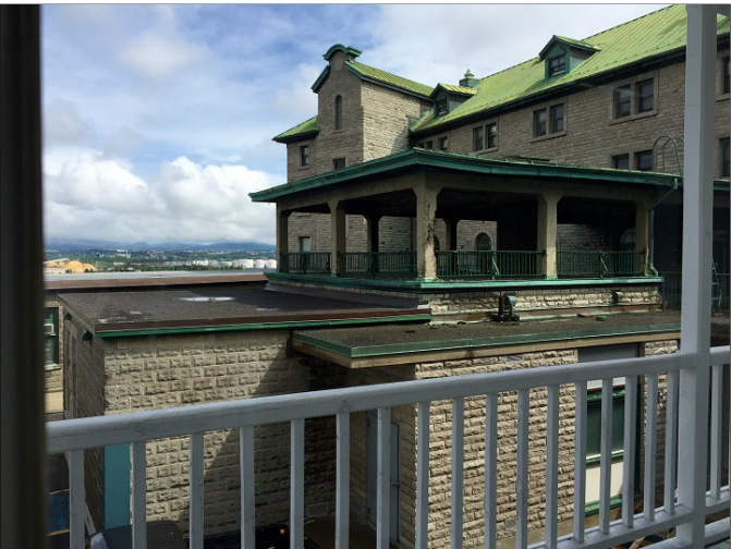
Historic Augustine Monastery to be transformed into trendy hotel in Quebec City. June 29, 2015.